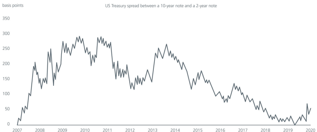
Fig 3: Yields have declined substantially since GFC

In our view, the unprecedented fiscal stimulus we have seen post COVID-19 can lead to binary outcomes. If the deficits sustain, the world will evolve more akin to post World War II with higher demand, higher inflation expectations, and steeper yield curves. Alternatively, if governments are forced to impose austerity measures once demand returns to normal, as with post GFC, then the era of low rates and low inflation will continue for the foreseeable future.